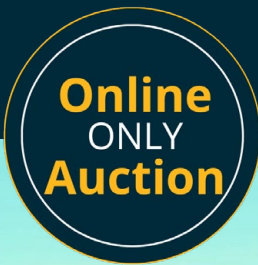
DEUEL COUNTY, NE